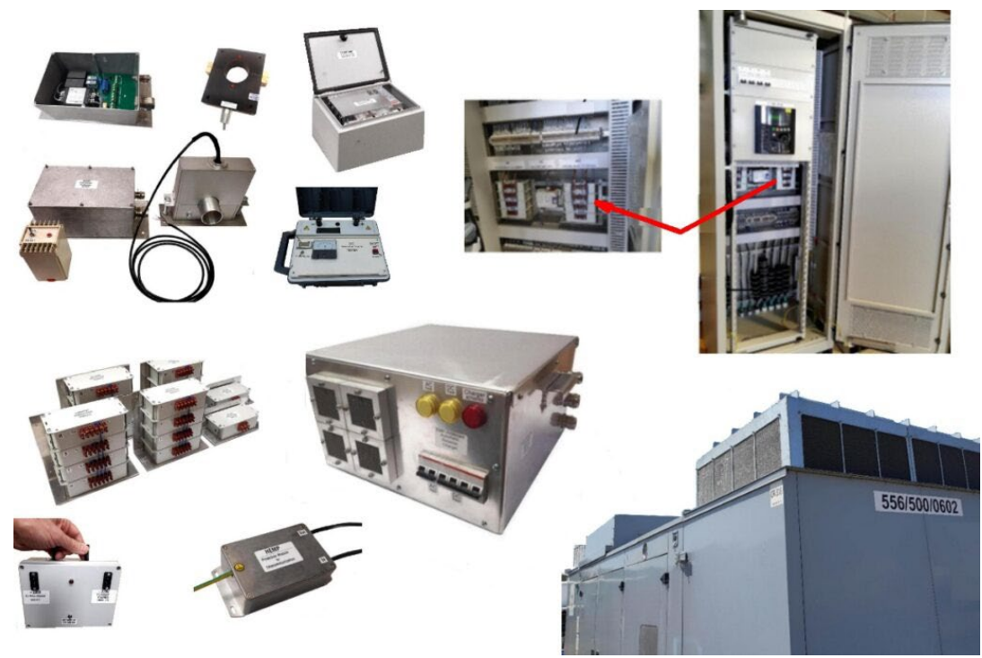
6. EMP protective means include power transformer protection, power main DC simulator, protection of control cabinets with electronic digital equipment, special EMP filters for civil equipment, automatic reserve EMP-protected battery charger for electrical substations, Ethernet telecommunication protective module, and even protective means for high-power backup diesel generators. Source: Vladimir Gurevich, PhD

The difference in the constructions, properties, and characteristics of various types of civilian equipment used in critical infrastructure facilities, their different location inside the buildings, the differences in the buildings themselves, and the presence of long cables connecting different types of equipment make their levels of resilience to EMP (and therefore the required levels of their protection) completely uncertain. The real level of EMP protection and the real level of resilience will be determined by the technical and economic capabilities allocated for a particular infrastructure.