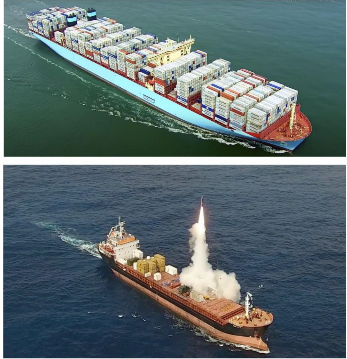
5. An ordinary civilian container ship loaded with hundreds of standard containers (top), and a LORA rocket launched from a container ship during a test (bottom).

The LORA missile system is not entirely unique. Similar systems are also being developed and manufactured by other countries. That is the actual situation. It is such that the Army is not in a position to provide a sufficiently reliable defense of the civilian infrastructure facilities and population centers from EMP, and as such, it is the electrical engineering specialists themselves that need to be concerned with this defense ahead of time. The lack of clear, understandable, technical-effective, and cost-effective solutions to the problem of protecting civilian critical infrastructure, suitable for practical application (and not for scientific reports only) for more than 50 years, indicates the existence of a very serious problem.