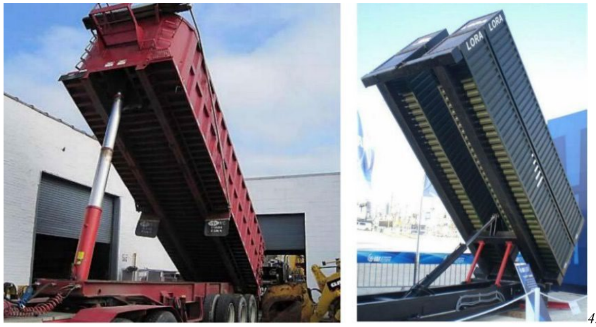
A conventional shipping container (left) and a LORA missile system container (right).

Especially dangerous are modern container-type missile systems, which are made in the form of an ordinary container with missiles hidden inside. For example, the Israeli LORA system (Long-Range Artillery Weapon System) is such a system. The launcher of the system differs very little from a conventional shipping container (Figure 4). Today, there are hundreds of millions of sea containers in circulation across the world. Nobody could know which of them are genuine and which might be filled with missiles.