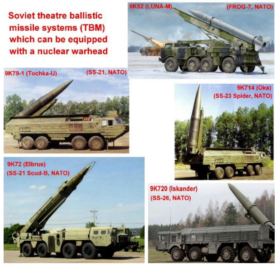
3. Soviet/Russian theatre ballistic missile (TBM) systems which can be equipped with a nuclear warhead (explosion yield up to 200 kt).

Concept D. Effective defenses against EMP are a national anti-missile defense system only into which more budgetary funds should be invested. Representatives of the military-industrial complex (MIC) frequently stand behind this view, and the concept seems to be quite effective. After all, the military and representatives of the MIC should know this problem better than anyone else. But, let's take a closer look at this concept.