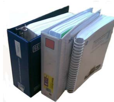
Fig. 4 Thick folios containing user information about DPD

Thus the relay protection maintenance would be simpler as the service staff would not need to read thick folios (Fig. 4) about different DPDs installed in the facility and study characteristics of the software of each DPD type.