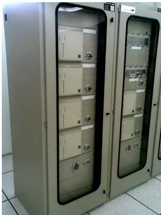
Fig. 2 The modern method of mounting the DPD in relay cabinets

To answer this question, let's trace how this remarkable business works. For example, what happens if some specific module of a specific DPD type at a given substation fails? This is what. Since there is no market for universal modules, the user can replace the failed module only and exclusively by the same one, produced by the same manufacturer. Thus, after you spent a small fortune to purchase the DPD from one of the manufacturers, you actually fall into the bondage of economic dependence on this manufacturer for the next 10 - 15 years, since after you have chosen one manufacturer it no longer matters if there are other manufacturers on the market as you can not use their products.