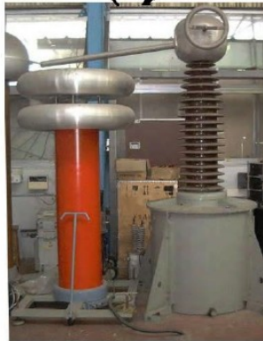
300 kV Test Transformer with Capacitance Divider