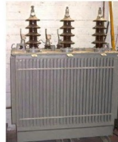
24 kV Transformer