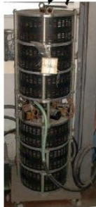
Variac with Distance Control