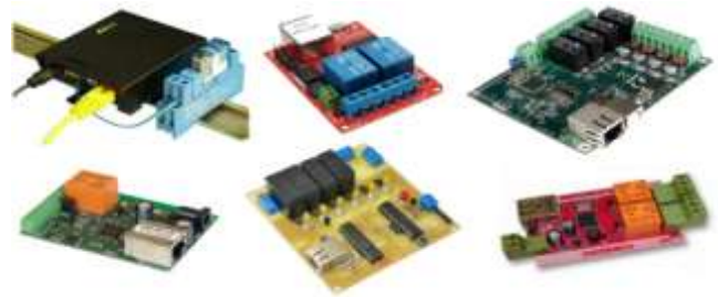
Fig. 7 Network relays with different number of channels and output electromechanical relays.

The so-called “network relays” (Fig. 7) are much cheaper (20 - 30 USD), but are equivalent to those described above.