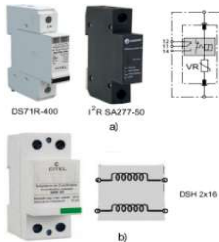
Fig. 10 Single-pole protection units with varistors (a) and a unit with two current-limiting chokes (b).

A unit of chokes DSH 2x16 manufactured by Citel is recommended as current-limiting chokes L1 – L2. This unit consists of two chokes rated 16A each, located in a small casing, which can be mounted on a standard DIN-rail (Fig. 10b).