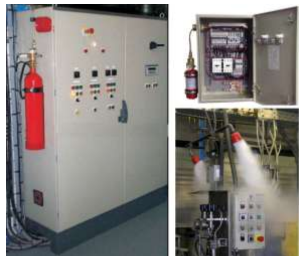
Fig. 1 Local gas and spray fire suppression systems for low voltage control cabinets

single cabinet or a group of cabinets (Fig. 1) to centralized systems, which consist of rather sophisticated and branched systems (Fig. 2). Local systems based on a single gas balloon and a simple temperature sensor do not consist of sophisticated electronic components, and thus it is unnecessary to protect them from HEMP.