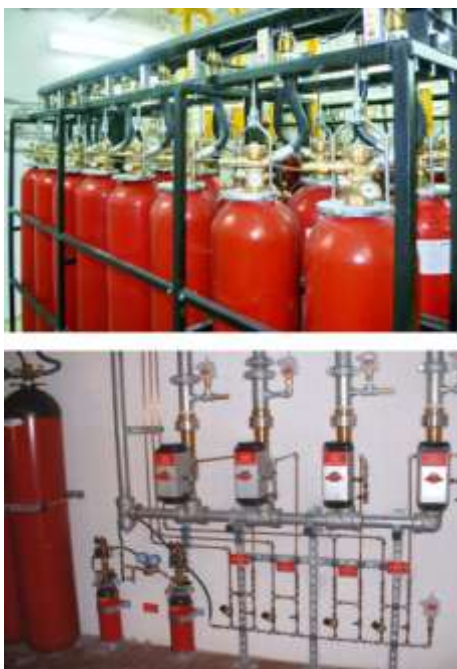
Fig. 2 Components of centralized gas fire suppression system

Control panels (cabinets) of a fire alarm and automatic control are very sophisticated. They consist of microprocessors and many different microchips (Fig. 4), connected through dozens of cables that create a branched antenna system (hundreds-meter long), which absorbs the HEMP energy from a large area and delivers it directly onto highly-sensitive electronic components.