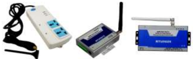
Fig. 8 Remote switches controlled via Global System of Mobile Communications (GSM).

The GSM remote controller (Fig. 8), which costs 100 - 150 USD, can be used as a device for remote switch off the fire extinguishing systems.