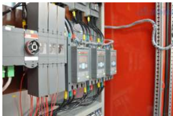
Fig. 5 Power electronic devices to control electrical motors of centralized fire extinguishing system's pumps.

These systems are built based on network technologies at large facilities. Thus, firefighting control panels are equipped with RS422 or RS485 interfaces; they can also communicate via Ethernet or by means of modem transmission over a dial-up telephone channel, which makes it even more susceptible to HEMP and complicates their protection.