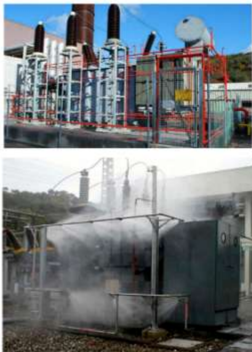
Fig. 3 Fire extinguishing for power transformers: above – red fire piping with sprinklers; below – fire extinguishing in progress.

Control panels (cabinets) of a fire alarm and automatic control are very sophisticated. They consist of microprocessors and many different microchips (Fig. 4), connected through dozens of cables that create a branched antenna system (hundreds-meter long), which absorbs the HEMP energy from a large area and delivers it directly onto highly-sensitive electronic components.