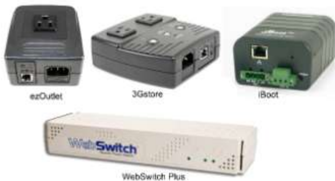
Fig. 6 Remote power switches

In practice, remote switch off of automated fire suppression systems can be achieved using various tools readily available in the market. These can be relatively expensive (200-300 USD) remote power switches installed in separate casings (Fig. 6) and controlled via Ethernet. These switches are equipped with network interface and output electromagnetic relays, which respond to a special code, transmitted by network. The terminals of these relays can switch external devices either off or on.