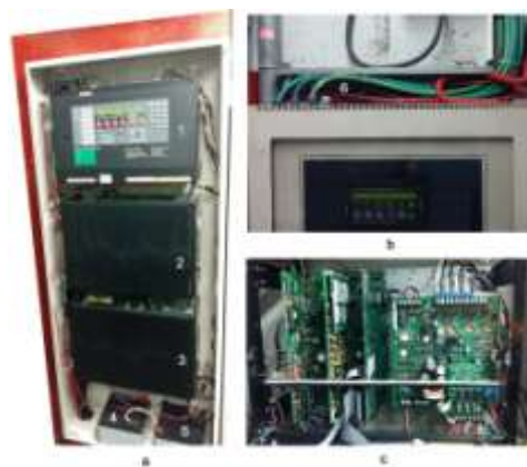
Fig. 4 Control panel (cabinet) of fire alarm (a) with three control units (1, 2 and 3) and accumulators (4, 5); 6 (b) - external multi-core cables, connected to internal electronic circuit of the cabinet; c - microelectronic "internals" of one of three control units of the cabinet.